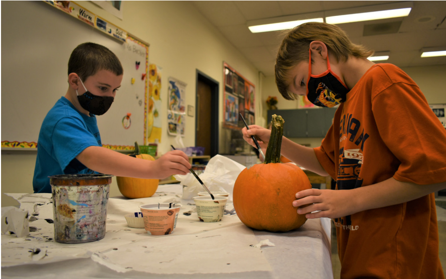
Students at Radez Elementary decorate pumpkins for the school's annual Turkey Trot. The pumpkins were placed around the village of Richmondville as decorations.